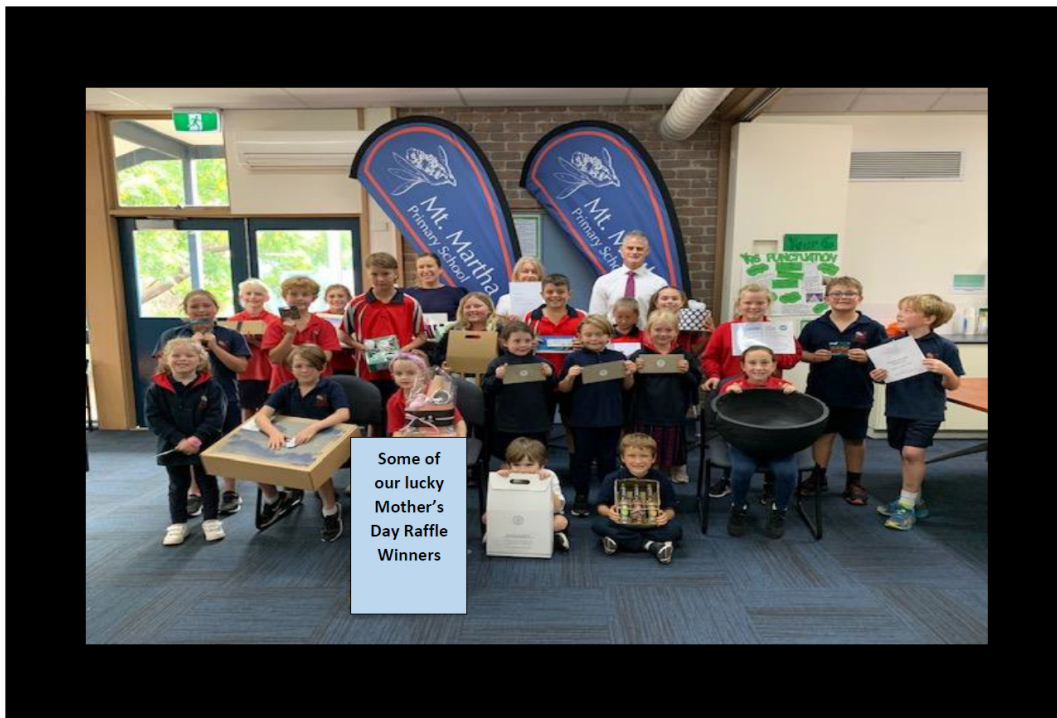
Some of our lucky Mother's Day Raffle Winners

There was great excitement on Friday when the raffle winners were announced. Some of our excited students are pictured above with their prizes. We hope our lovely Mum's had a fabulous day on Sunday and enjoyed their surprise gifts.