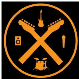
Nepean Music Centre