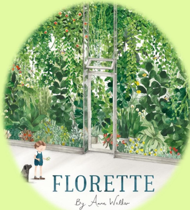
Illustration used with permission.

Help us green our world just like 'Florette.'